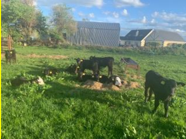
New Born Calves

What do you think they will be when they grow up?